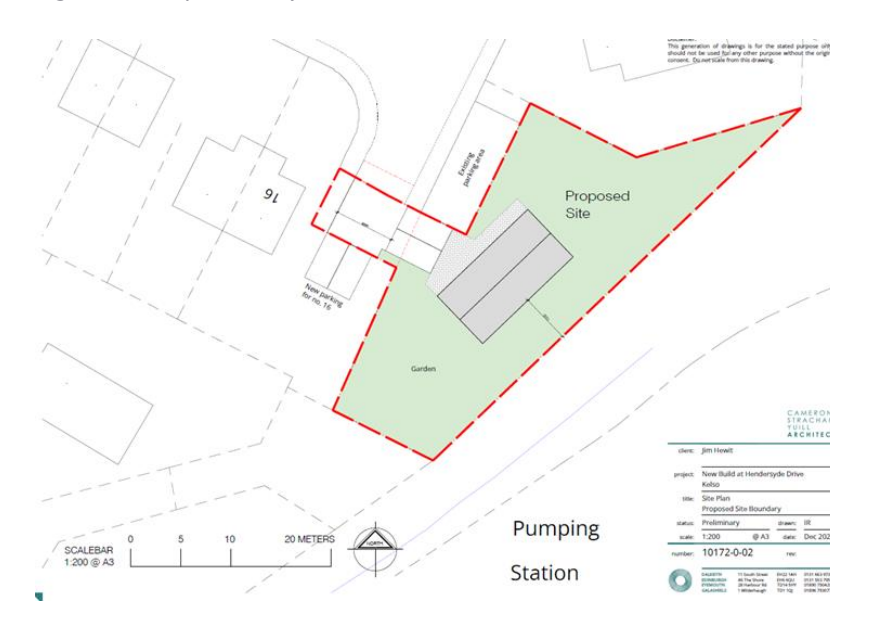
Figure 2: Proposed Layout Plan

3.2 The proposed development involves the provision of a single detached residential property with associated infrastructure, adjoining 16 Hendersyde Drive, to the east of the Col-de-sac, within the settlement boundary of Kelso. The indicative site layout plan is identified below and within the submitted Core Documents.