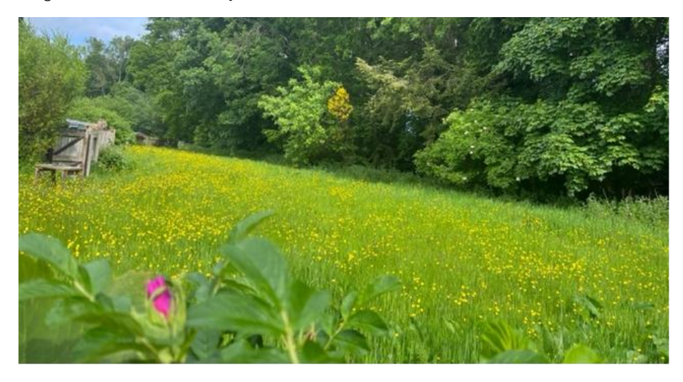
Figure 6: Photo taken beyond the fence line from the west of the site

Figure 5: Photo taken beyond the fence line from the west of the site