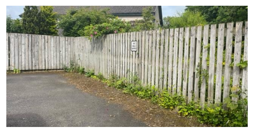
Figure 4: Photo taken from the west of the site adjoining Hendersyde Drive

Figure 3: Photo taken from the west of the site adjoining Hendersyde Drive